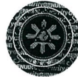
FERDINAND ROMUALDEZ MARCOS JR. President of the Philippines