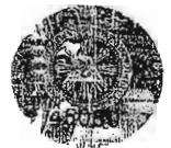
EDUARDO R. ERMITA